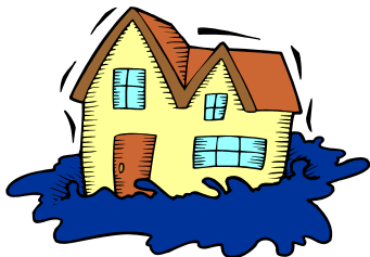
“Flooded Home -- Don’t let this happen to you”

Floodplain maps and information may be obtained from the Sanitation and Zoning Office. An official Floodplain Survey may be required to determine floodplain boundaries in some instances. Check with the Sanitation and Zoning office for special requirements and permits required when building in a floodplain.